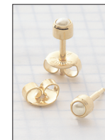
Regular 89044 Simulated Pearl