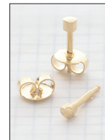
Mini 89062 Heart