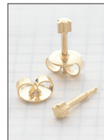
Mini 89060 Star