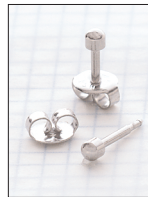
Mini 89047 Ball