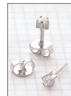
Regular 89039 Cubic Zirconia