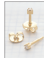
Mini 89066 Cubic Zirconia