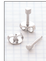
Mini 89063 Heart