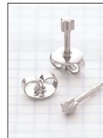
Mini 89061 Star