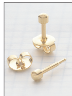
Mini 89046 Ball