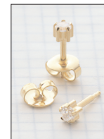
Regular 89038 Cubic Zirconia