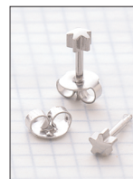
Regular 89041 Star