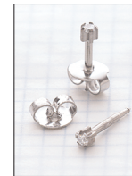
Mini 89067 Cubic Zirconia