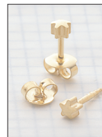
Regular 89040 Star