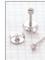
Mini 89065 Simulated Pearl