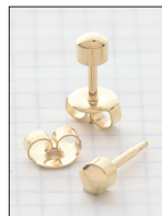
Regular 89000 Ball