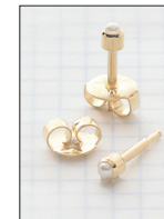
Mini 89064 Simulated Pearl