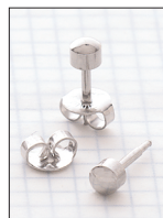
Regular 89001 Ball