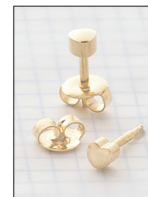
Regular 89042 Heart