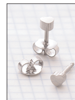
Regular 89043 Heart