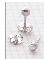
Regular 89045 Simulated Pearl